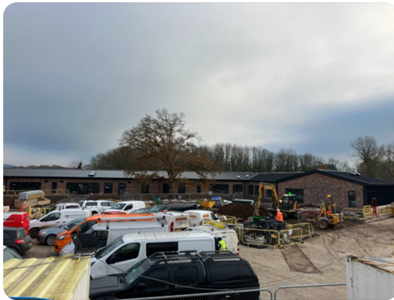
Picture: Baytree School in Clevedon in December 2023

There has been great progress expanding Baytree School with the building fast approaching completion both inside and out. It has been a long road since proposals were initially developed and a planning application submitted, so it is great to see that the school expansion will soon be a reality.