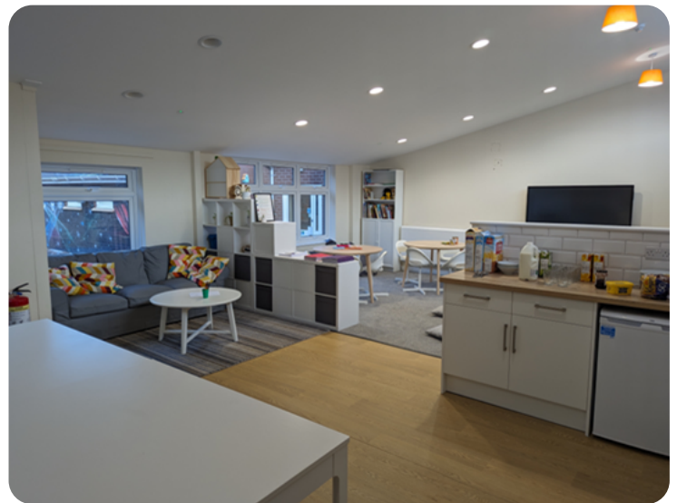
Picture: Crockerne CE Primary School's Nurture Group space